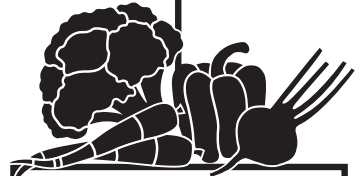
VEGETARIAN & VEGAN