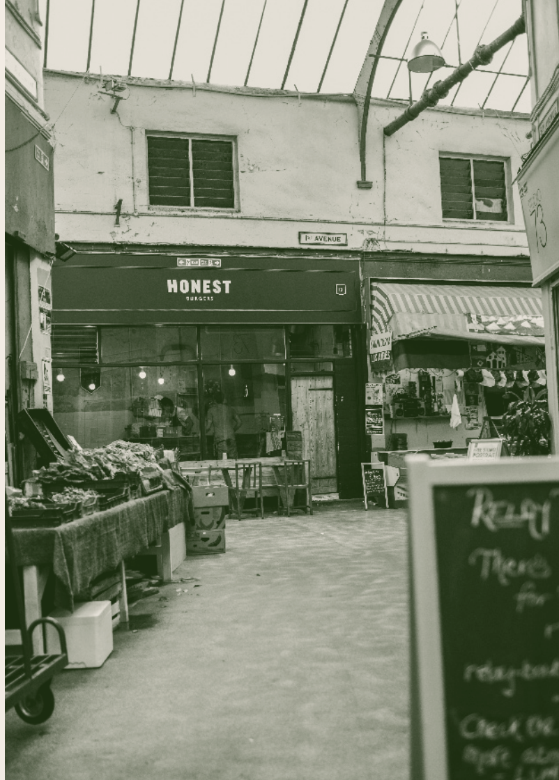
The first Honest Burgers in Brixton Village

We never set out to open an American diner, or to make burgers we'd eaten on our travels. Our way was always about making burgers you could eat at a British farmers' market, in wellies, in the rain.