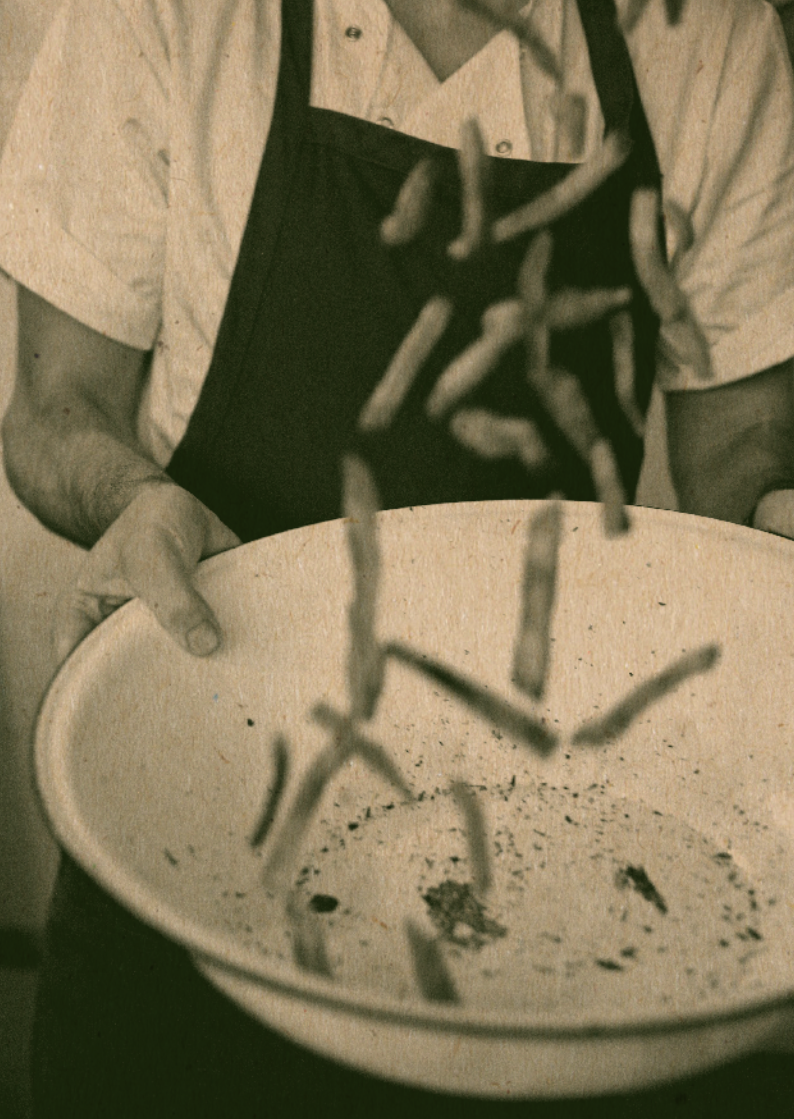
Homemade and hand-seasoned rosemary salted chips