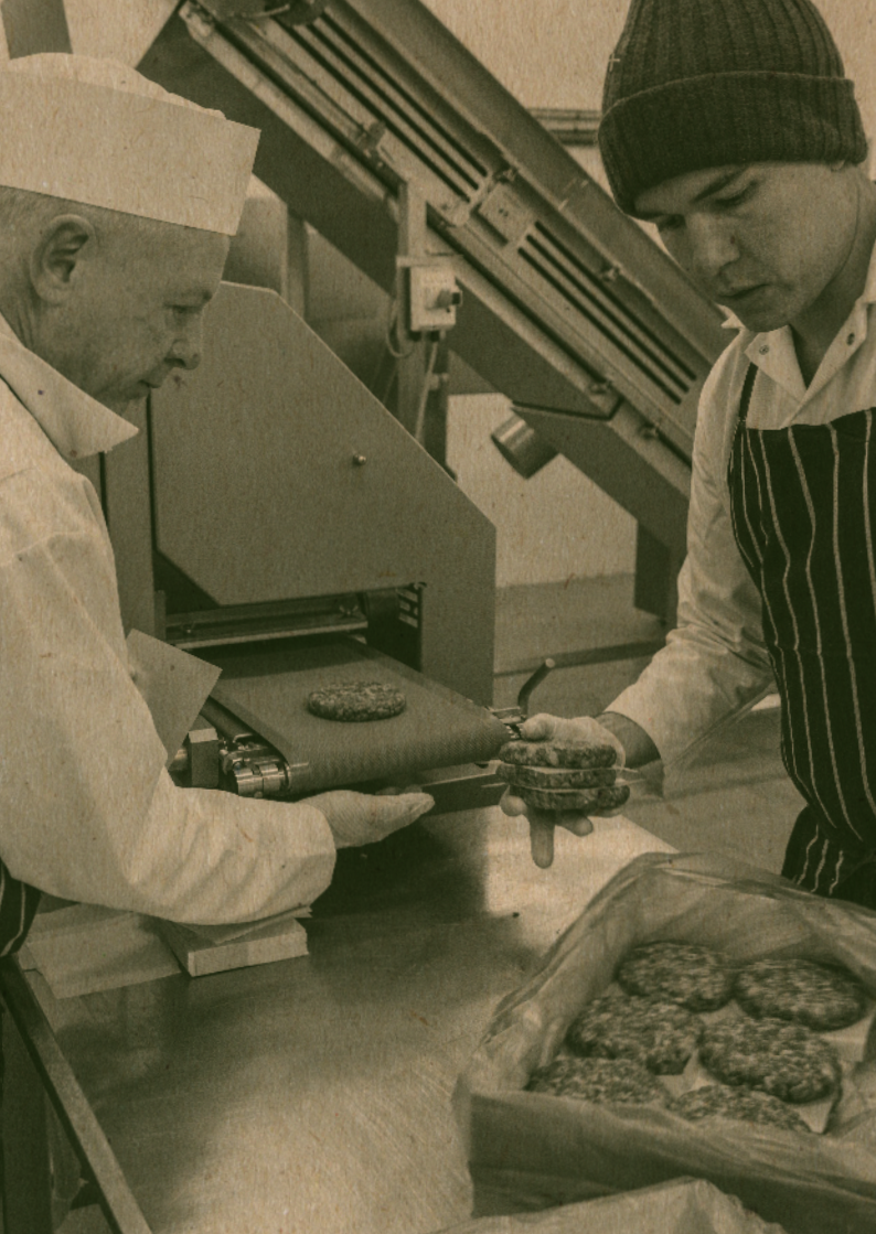
The first box of homemade Honest burgers