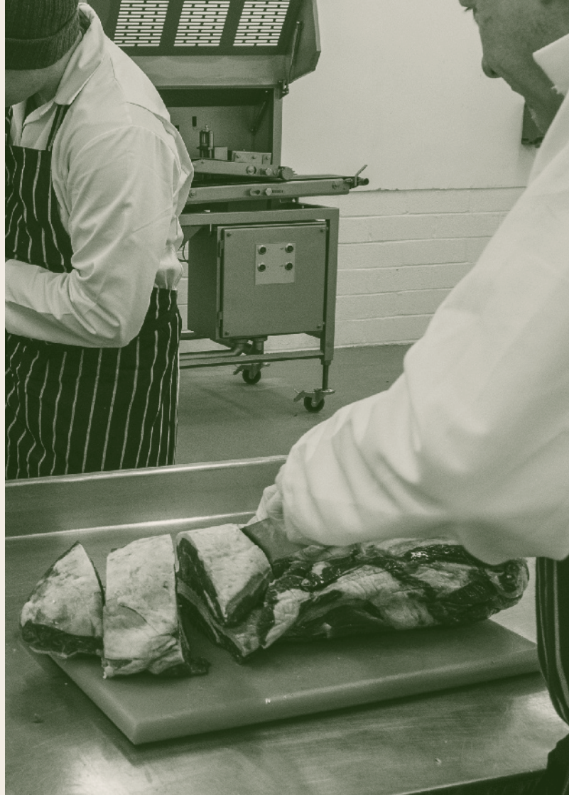
Rib cap being cut by hand

We've always made our burgers from chuck and rib cap (the fatty bit that's skimmed off a rib eye steak). It's more expensive, but it makes our burgers juicier and chunkier, with a 'good bite'. It means you can actually taste the beef – really great beef – not just meat. And that's exactly how it should be.